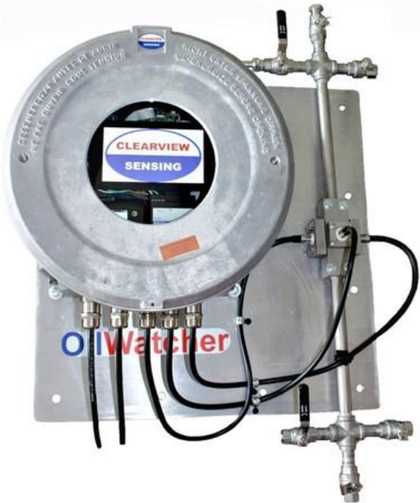
MODEL 43H (Hazardous Area - C1D2)