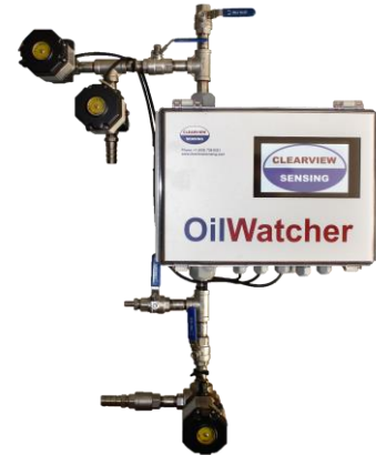
A Non-Hazardous Location Unit (Model 43A, Main Module)

OilWatcher is simple to use, has flexible configurations and requires minimal maintenance. It can be used online or single sample, and can be configured with manual cleaning, semi-automatic and fully automatic cleaning. It has uses in produced water disposal for oil and gas production, water treatment facilities, laboratories, refineries, desalination plant, and more.